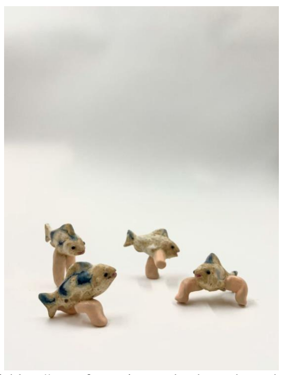
A set of "Fishlegs", my favourite works throughout the internship